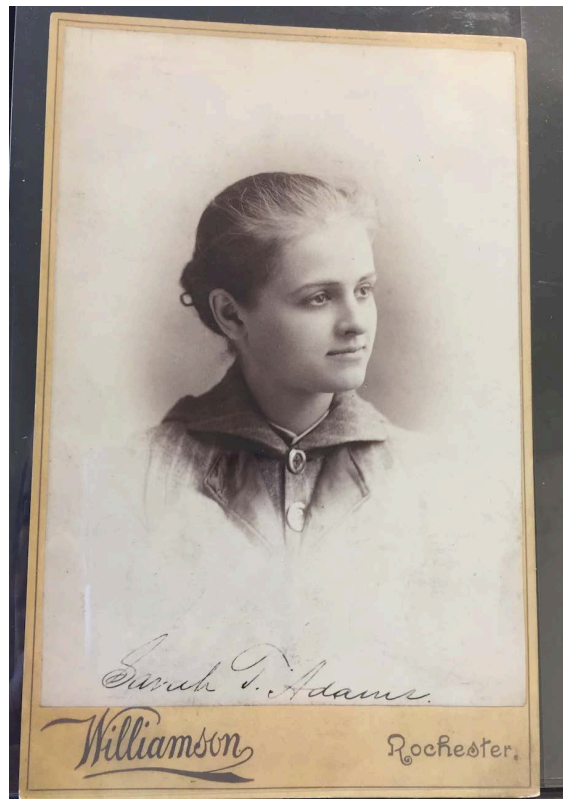
Other photographs